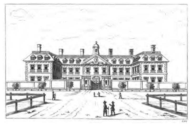
Clarendon House, Piccadilly

Biography can only recount what is known, or has been said. A scrupulous and praiseworthy research for accurate knowledge, or possibly even a less worthy motive, the love of detraction, might inspire the wish to bring to light every hidden failing of disposition or fault in conduct in historical characters; but, if such have been concealed at the time, or been left unrecorded, whether from kindness or from policy, nothing will be added by mere conjecture or invention to that truth which every reader of history should desire and seek.